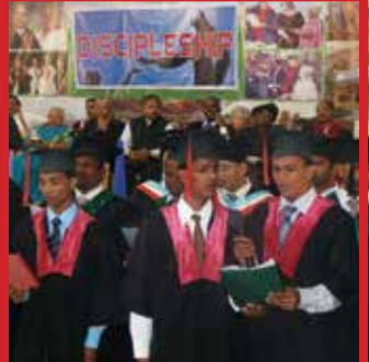
COTR Graduates ready for the field.