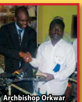
Archbishop Orkwar gives a bicycle to a village pastor.