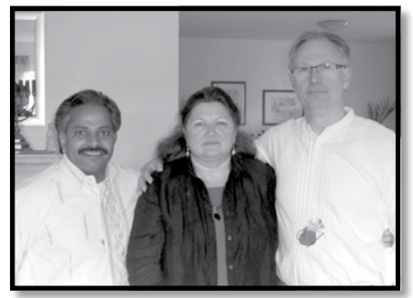
Christ for India ministries in Germany partners with Pastoren Helfen Pastoren e.V.